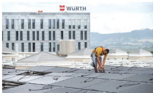
Adolf Würth GmbH & Co. KG plans to build photovoltaic systems on a total surface area of up to 28,000 m 2 in the final construction stage on the campus in Künzelsau and the nearby logistics hub in Gewerbepark Hohenlohe industrial park in 2022.