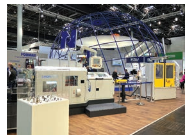
exhibit space in 16 exhibition halls. Focus was on the future including AI, robotics, renewable energies and the energy transition. Visitors came from 130 countries. wire & Tube 2028 will be April 3 to 7, 2028 in Düsseldorf, Germany. www.wire-tradefair.com • www.mdna.com

Presented by: Fastener TECHNOLOGY INTERNATIONAL